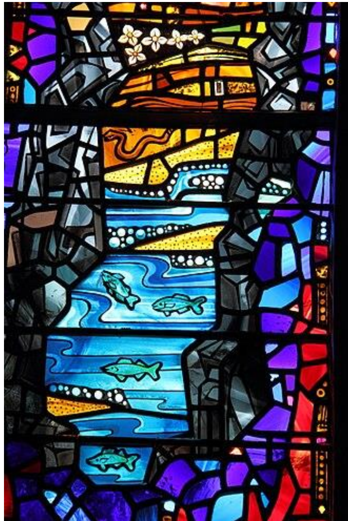
Beauty of Creation,

First Sunday After Pentecost: Trinity Sunday Sunday, June 4 th , 2023 Holy Eucharist & Agape Gathered & Livestreamed