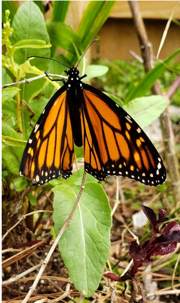
New, life monarch.