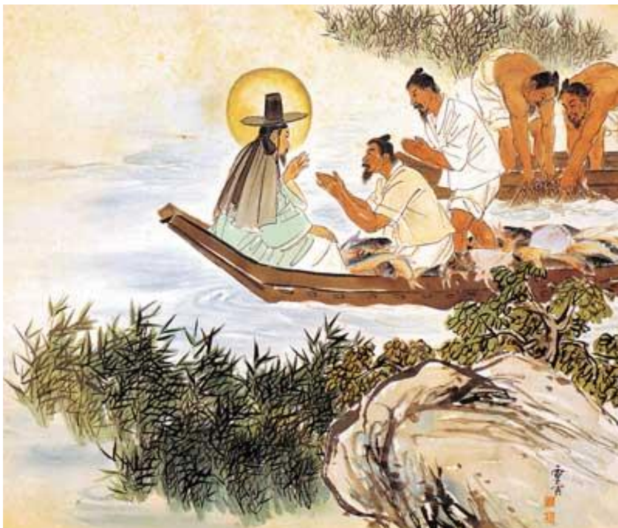
Jesus calls his first disciples, Woonbo Kim Ki-chang (Korean)