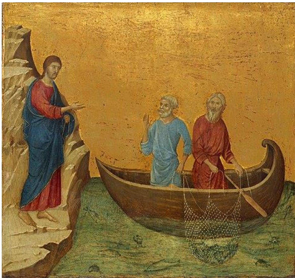
The Calling of the Apostles Peter and Simon, Ducio de Buoninsegna, 1308-1311