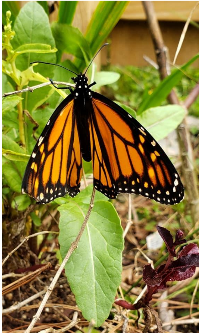
New, life monarch.