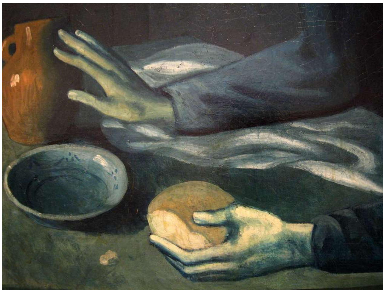
Pablo Picasso, The Blind Man's Meal (detail)