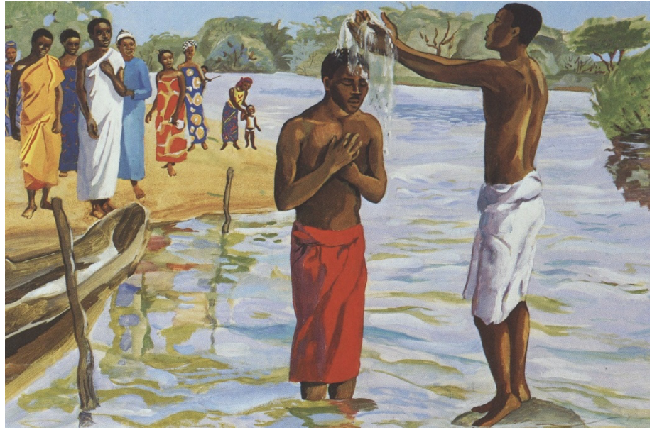
Baptism of Jesus, Jesus Mafa

Let us join with those who are committing themselves to Christ and renew our own baptismal covenant.